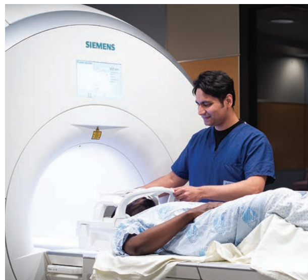
Magnetic Resonance Imaging (MRI) services

A centralized intake process now helps connect outpatient referrals to 10 MRI locations across the region, improving the use of resources and optimizing scanning times. This provides easier and more equitable access to MRI services by reducing the variability in wait times between sites. Patients and their Physician can now choose a centre with the shortest wait or one closest to home.