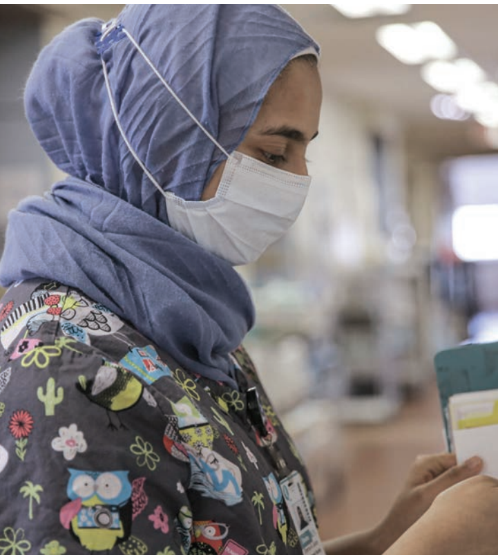
The QCH Family is diverse and dedicated

Diversity extends beyond race and ethnicity — spanning language, gender, religion, sexual orientation, abilities and economic status. It helps us be a stronger organization and provide better care. QCH actively seeks to enrich its culture, and added several initiatives this year, including job fairs for new Canadians, indigenous training for staff, and representation from Muslim and Jewish communities in our spiritual care service. Our Ethics Committee included diversity discussions as part of its agenda, and we implemented cultural sensitivity training for new hires. We still have work to do, of course, and have recently surveyed staff on what improvements we should focus on next.