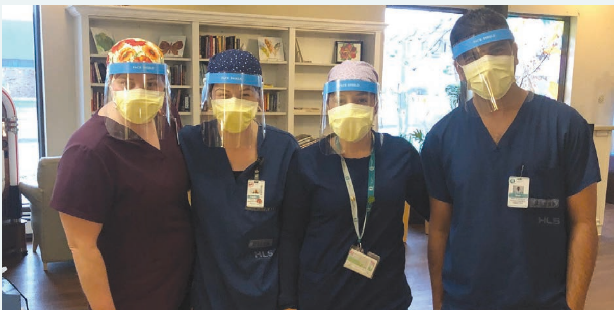
Members of QCH staff supported Carlingview Long Term Care home

The QCH ICU quickly filled up and the hospital opened a second ICU in our surgical recovery area — one designated for non-COVID patients. The team rose to the challenge and did everything they could to be able to provide care to ICU patients, including re-learning skills specific to intensive care and reconfiguring their entire unit.