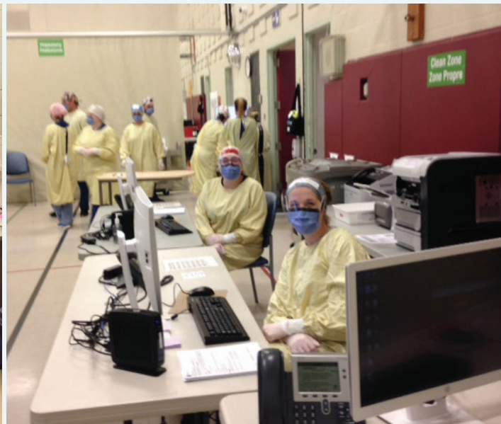
Diagnostic Imaging and clinical staff at the West COVID-19 Care Clinic