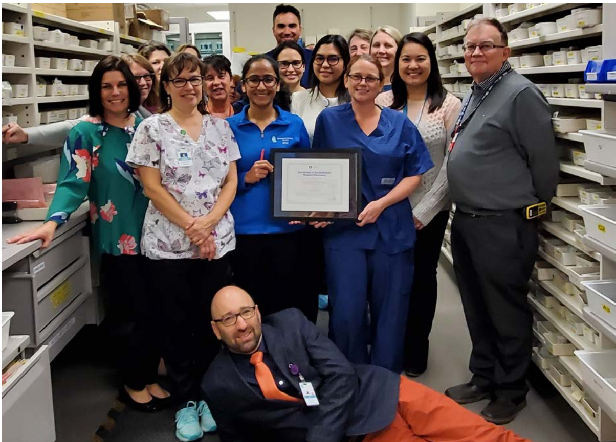
Accreditation success - a team effort! Our Pharmacy team also successfully completed their Accreditation.

QCH was ranked first among Ottawa-area hospitals, and 25th nationally in Newsweek Magazine's 'World's Best Hospitals' 2019 rankings. Their survey is based on the recommendations of medical professionals, patient survey results, and medical key performance indicators (KPIs). The list includes international institutions like the Mayo Clinic, Johns Hopkins, and the Cleveland Clinic, in addition to Canadian hospitals such as Toronto General Hospital and Sunnybrook Health Sciences Centre.