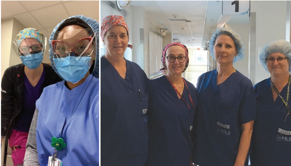
Proud members of the ACE team (Acute Care of the Elderly) and Operating Room nurses