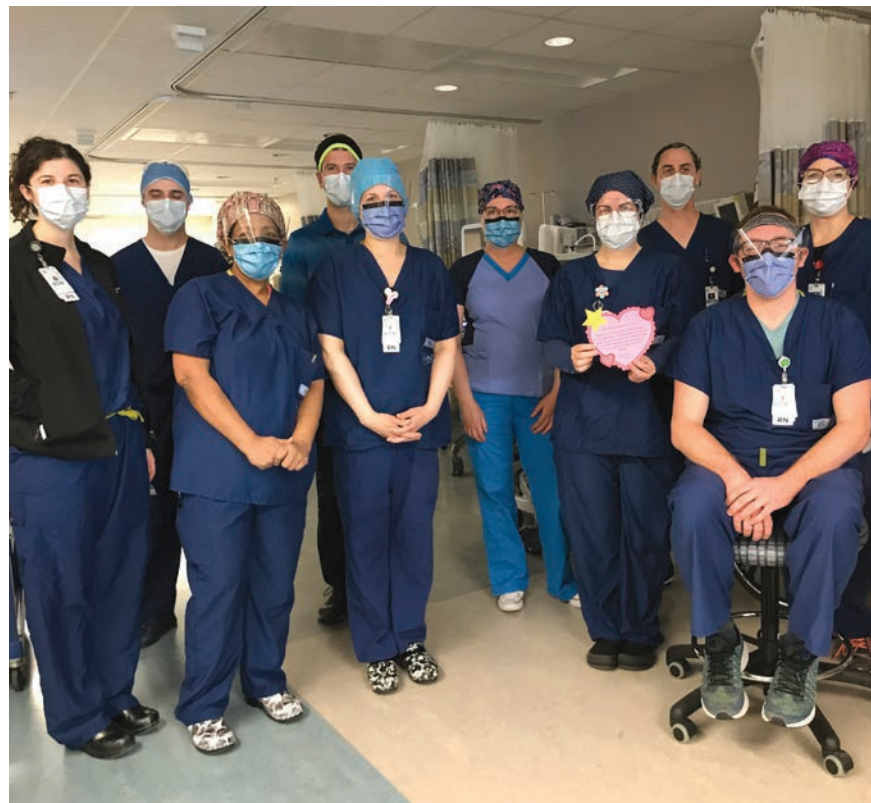
Part of our Intensive Care Unit (ICU) Surge team