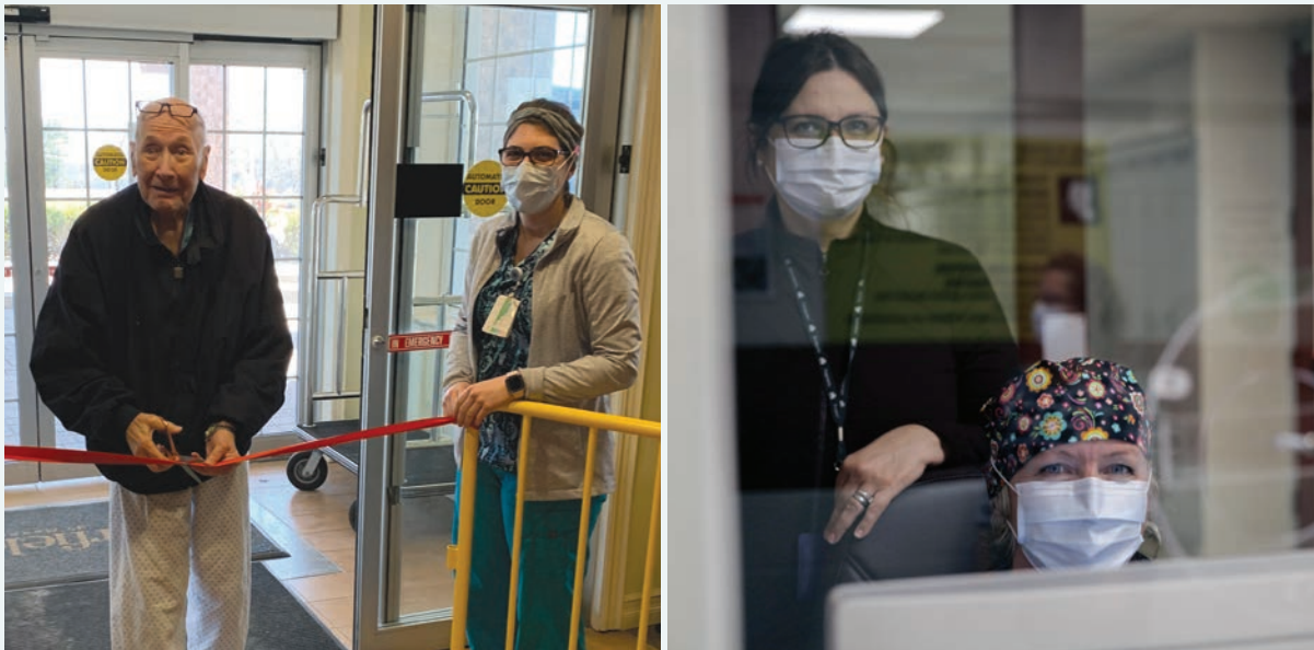
Fairfield's first patient, Staff behind protective barriers

The story of COVID-19 is far from over. We optimistically look forward to telling the full story of how we tackled this virus together as a community in our annual report next year.