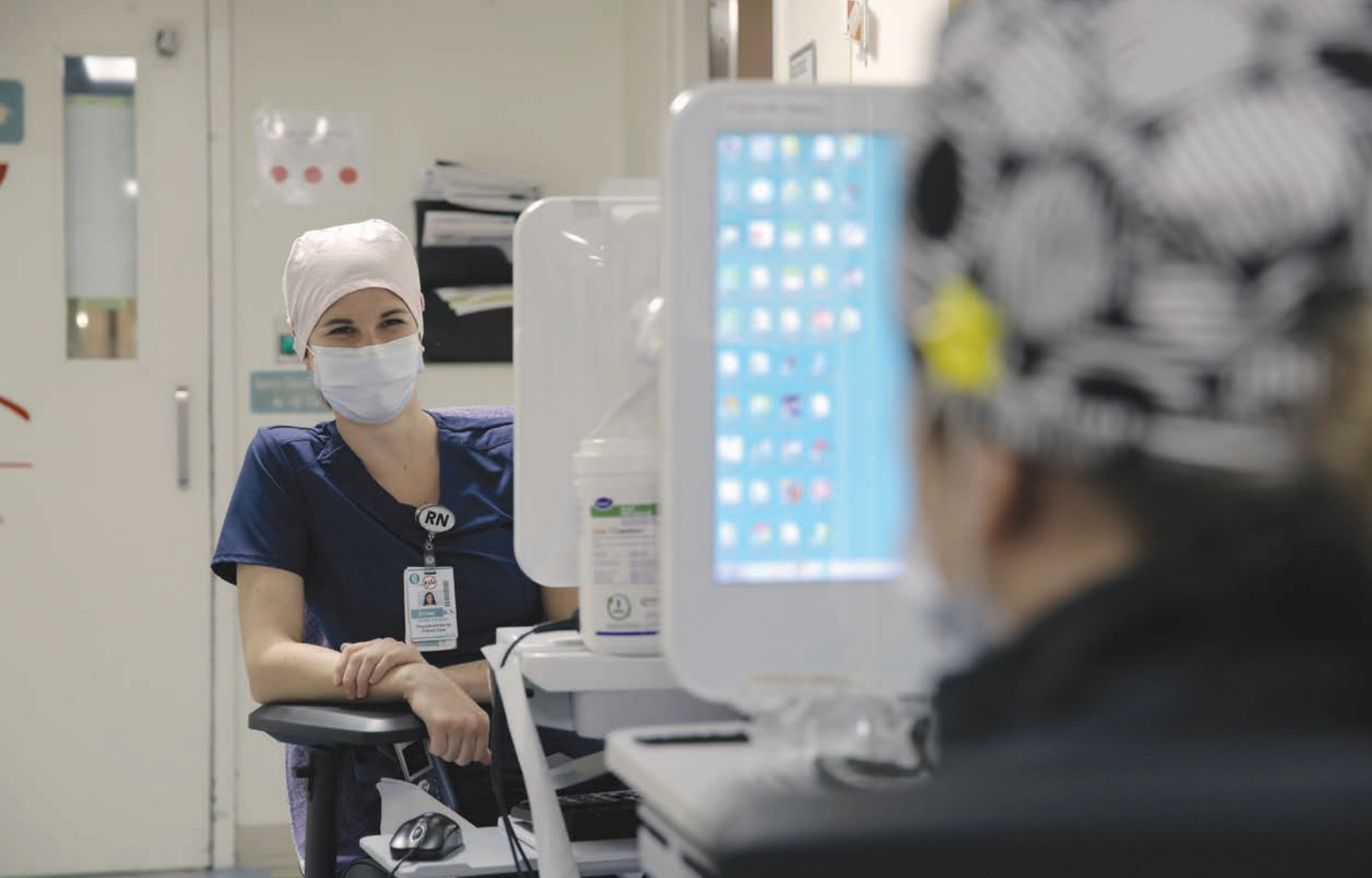
Pediatric nurses using our mobile Workplace on Wheels (WOWs)