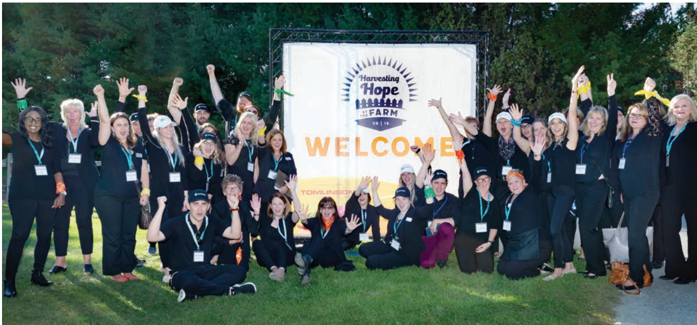
QCH Foundation and Hospital volunteers at the Harvesting Hope at the Farm fundraising gala, September 2019

In November, the Foundation was thrilled to host its first Women In Philanthropy Voting and Celebration Event at the Brookstreet Hotel, Ottawa. The purpose of this event was to celebrate a successful first year for this unique program, and to give members the opportunity to choose much-needed equipment to collectively fund for 2019. After hearing three very compelling pitches from our hospital team, members voted to fund a new bladder scanner and a mechanical ventilator for QCH patients. This exciting initiative brings together like-minded women in our community who want to help transform healthcare for Ottawa and our region.